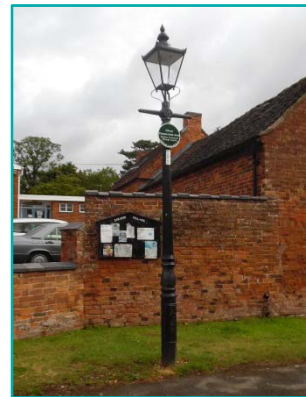
Street light, Sibson