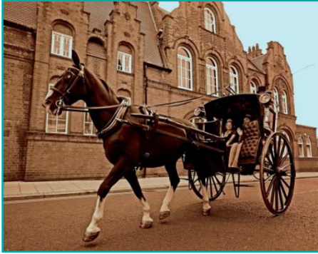
The restored cab on Station Road, Hinckley