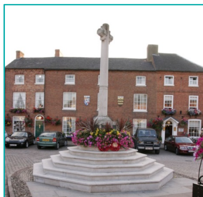
The market place at the centre of Market Bosworth Conservation Area

which have been designated as an area of special architectural or historic interest. Such areas include the length of the Ashby Canal within the borough, centres of the hosiery and boot and shoe industries, historic town and village centres, and areas around historic parks.