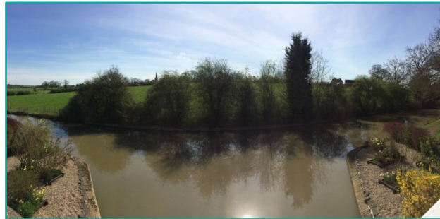
Panoramic view of Crown Hill at Stoke Golding, location of the crowning of Henry Tudor in 1485

1 Registered Battlefield , identified by Historic England to offer protection through the planning system due to its national significance. The Battle of Bosworth in 1485 marked the end of the Plantagenet dynasty as King Richard III was killed in the battle leading to the crowning of Henry Tudor and the ascension of the Tudor dynasty. King Richard III's reinterment took place at Leicester Cathedral in 2015 following the discovery of his remains in a car park, with his cortege procession passing through key locations across the battlefield and through Market Bosworth and associated villages.