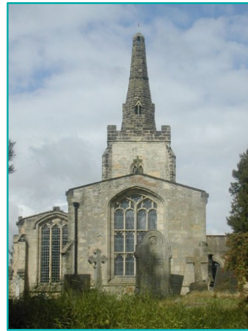
Church of St Edith, Orton on the Hill. A C14 grade I listed building

340 statutory listed buildings , designated by the DCMS on the advice of Historic England to mark and celebrate a building's special architectural or historic interest. Listed buildings are graded according to their quality and interest and within the borough 8 are listed at grade I, 36 are listed at grade II* and 296 are listed at grade II. There is a wide range of buildings and structures on the list including churches, farm houses and farm buildings, cottages and manor houses, war memorials and commemorative structures, former hosiery industry buildings, public houses, walled gardens, bridges, railings, telephone boxes and village pumps.