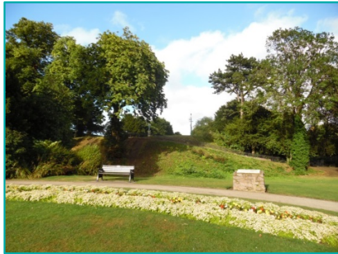
Remains of the motte and bailey castle in Hinckley, a scheduled monument

22 Scheduled Monuments , designated by the DCMS on the advice of Historic England to recognise the national importance of these archaeological sites. Types of monuments in the borough include Neolithic bowl barrows, an Iron Age hill fort, Roman villas and settlements, Saxon burial mounds, Norman motte and bailey castles, Medieval moats and fishponds, farmsteads, manorial complexes and deserted villages. A great number of local archaeological sites are also recorded on the Historic Environment Record.