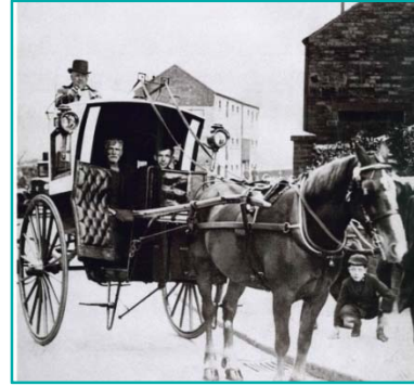
A cab near to Hinckley railway station, late-19 th century