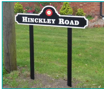
Street name plate, Dadlington

parish to utilise their existing or design an appropriate image that represents their area and to contribute to local distinctiveness. The lights consist of an ornate cast iron lighting column and lantern which complements and enhances each area, being far more aesthetically pleasing than modern lighting equivalents.