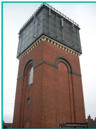
Hinckley Water Tower, constructed 1889. A likely inclusion within a local heritage list

A list of local heritage assets is being developed by the council with assistance from local stakeholders. The local heritage list will identify heritage assets that merit protection due to their contribution to local character and distinctiveness but do not meet the criteria to be statutory listed.