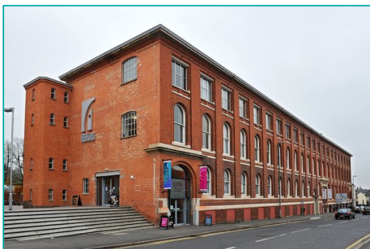
Atkins building exterior

With the aid of funding from East Midlands Development Agency (EMDA) and English Heritage the council purchased the grade II listed former Atkins hosiery factory and it has been redeveloped and converted to provide creative studios, serviced office space, an art gallery, café, and meeting and function rooms. It is currently thriving and a positive example of the constructive conservation of the borough's hosiery manufacturing heritage.