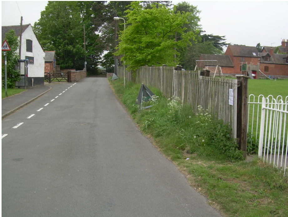
The existing hedge on the playing field needs continuing up Post Office Lane to help screen the existing fence