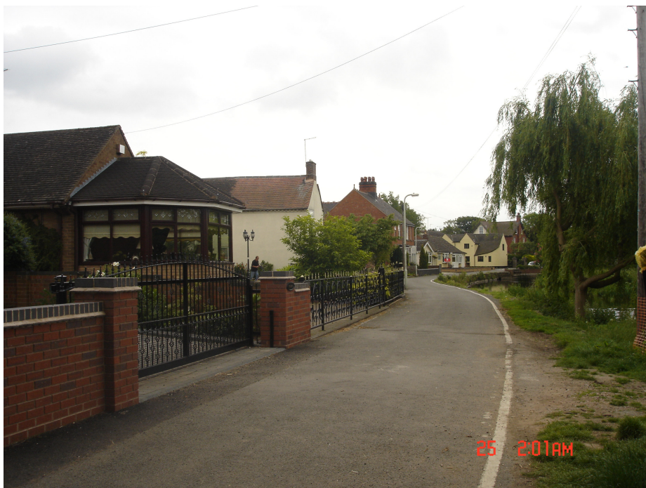
A view looking south along Riverside. The iron fences and gaps to frontages should be replaced with brick walls. The grass verge is also being eroded with cars using it for turning.