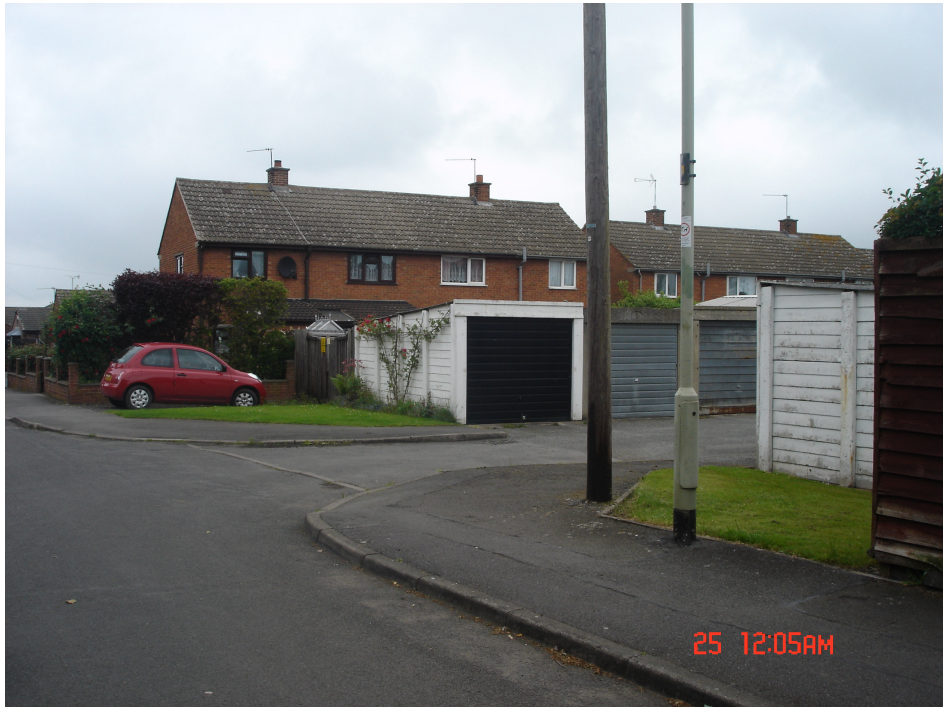
The communal garage site accessed off Mill Lane is a particularly unattractive development adjacent to the conservation area boundary