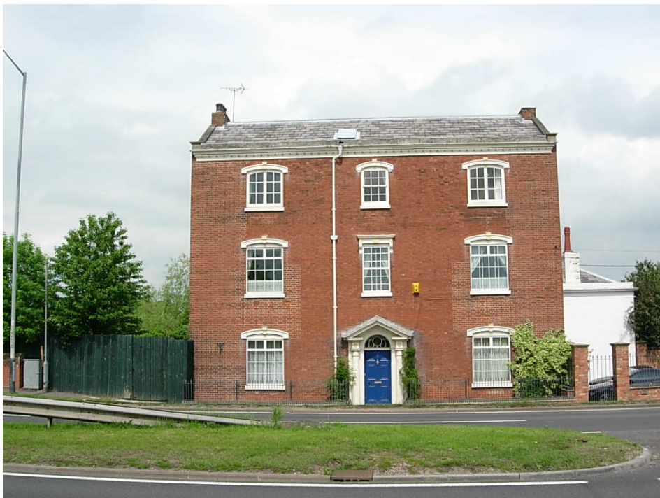
The property 2 Witherley Road is an attractive listed building fronting the A5 which would be visually improved if the existing timber fence was replaced with a brick wall built of a similar brick to the property