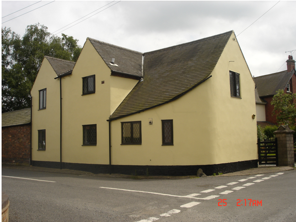
The dwelling situated at the junction of Hunt Lane and Bridge Lane is an attractive feature