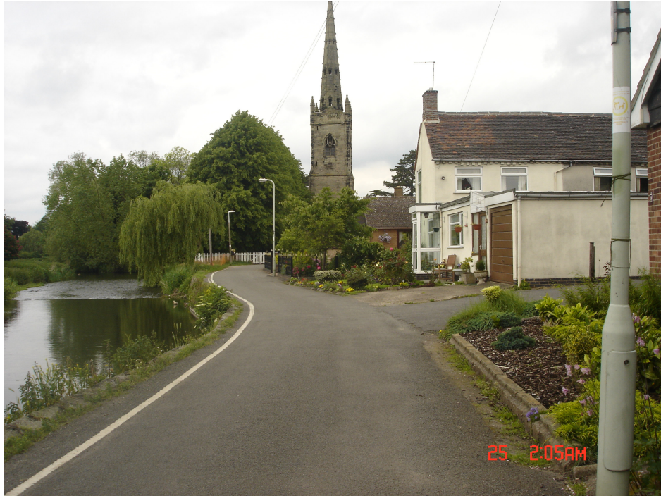
Looking back along Riverside towards the church showing gaps to the street frontage