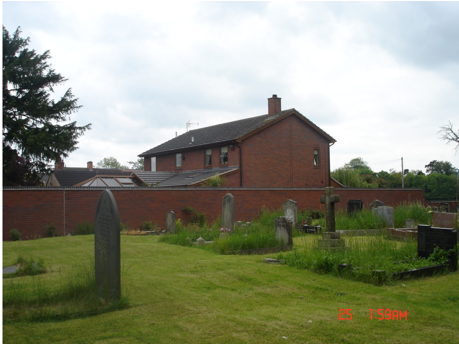
The modern bricks utilised on the boundary wall and new dwelling on riverside are unsympathetic in colour and texture