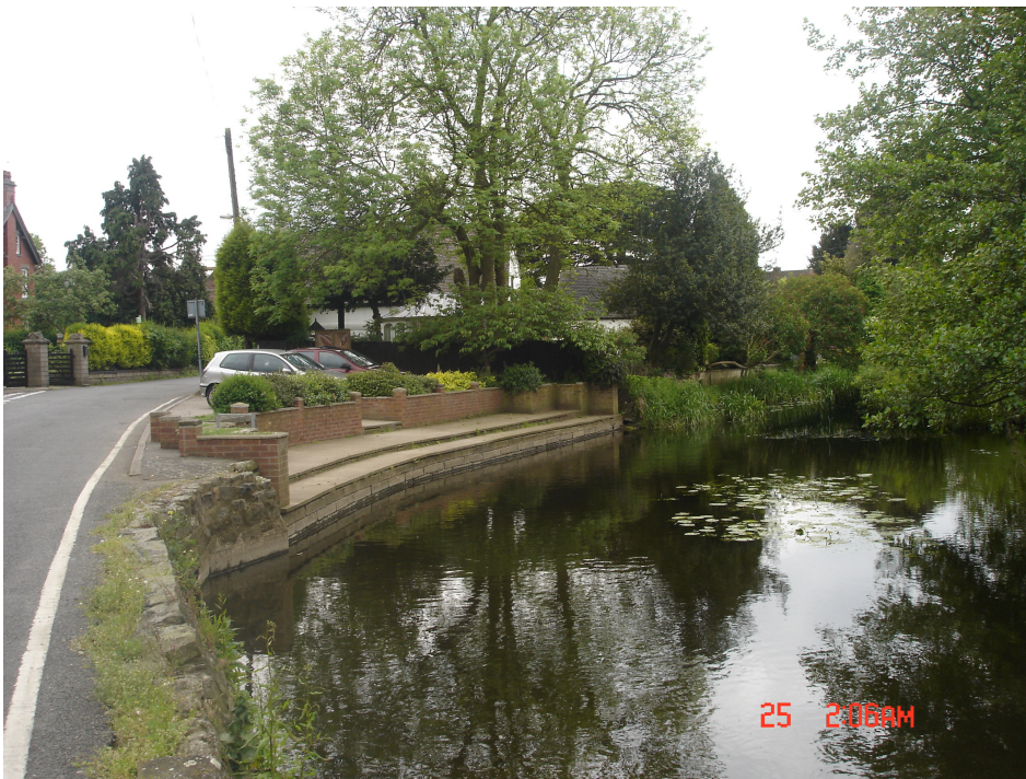
The picnic area on Riverside is in need of maintenance. In the long term consideration should be given to the re-design of the area