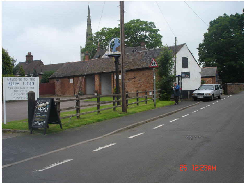
A brick wall fronting Post Office Lane would be more in keeping with the locality similar to wall fronting the pub's beer garden