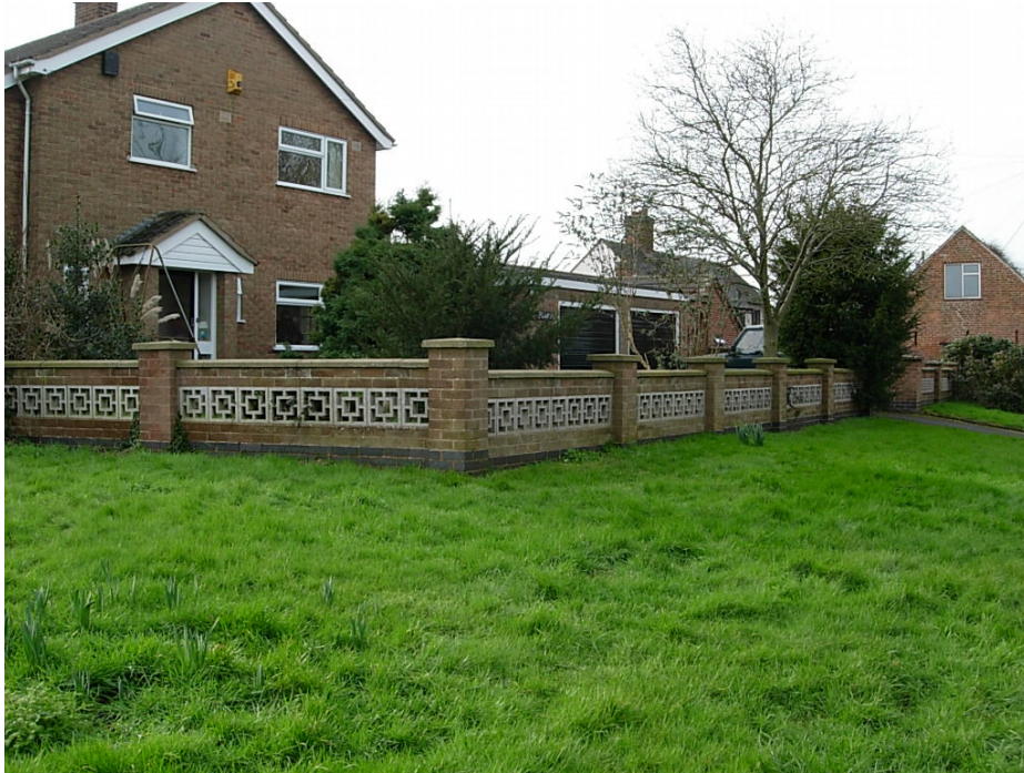
(13) Modern brick wall is an incongruent feature at the junction of Main Street and Shadows Lane. Its replacement with a Carlton Stone Wall would visually improve the junction setting