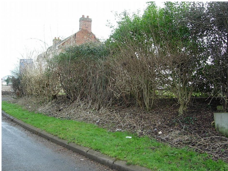
(10) Existing hedgerow on Barton Road needs replacing with Carlton Stone wall