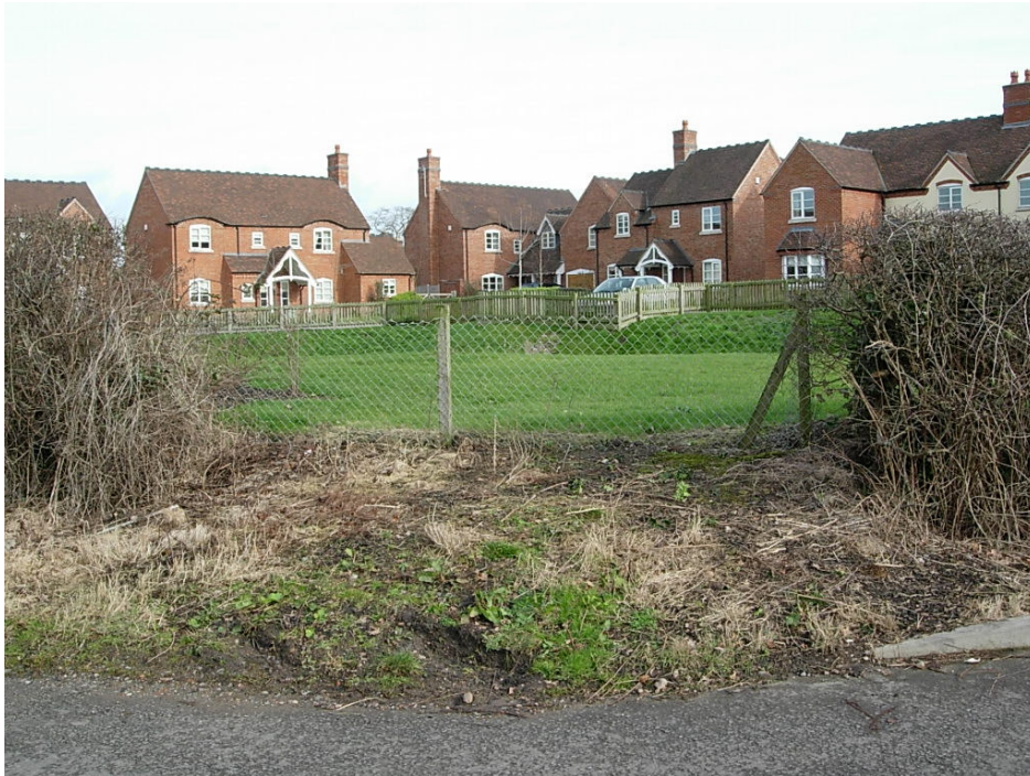
(15) Gaps in hedgerow need to be re-planted along boundary of new housing development on Shadows Lane