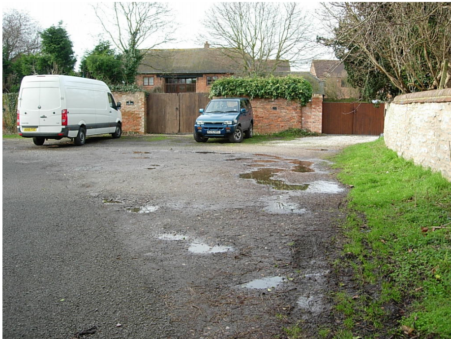
(14) The carriageway on Shadows Lane needs defining and the parking area re-surfaced in a traditional material