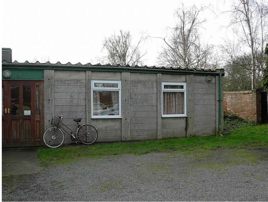
(11) Rear extension to the church hall is out of character with the main building