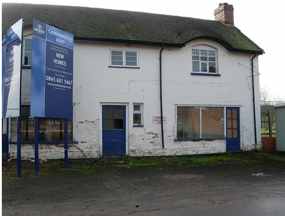
(9) The former village pub with eyebrow windows on Barton Road is to be restored