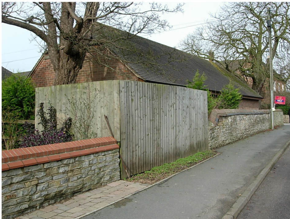
(16) Timber fence on Main Street needs replacing with Carlton stone wall to link up to adjoining walls