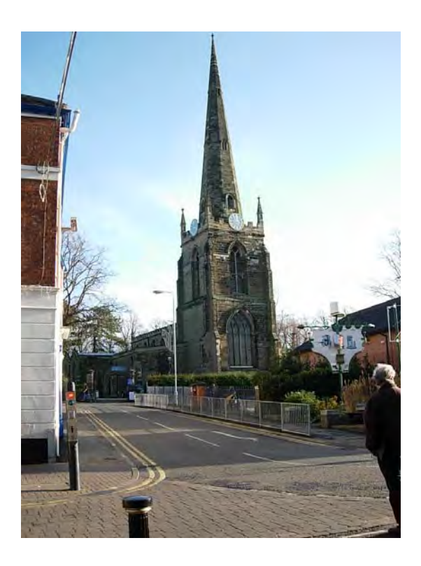
This is a key view of St Mary's church from the junction of Station Road and the Market Place.