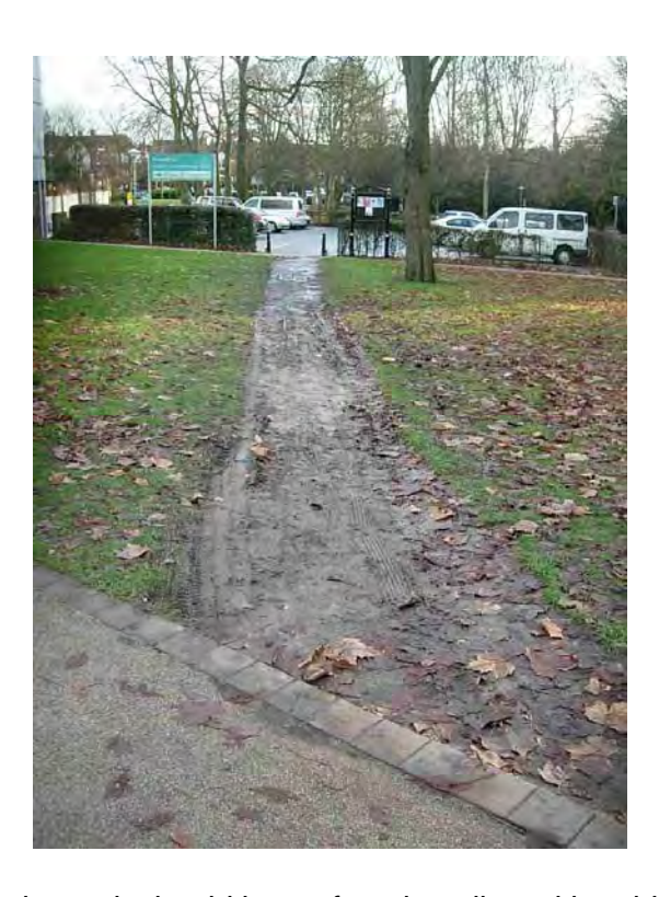
Pathways within the park should be surfaced to align with public desire routes.