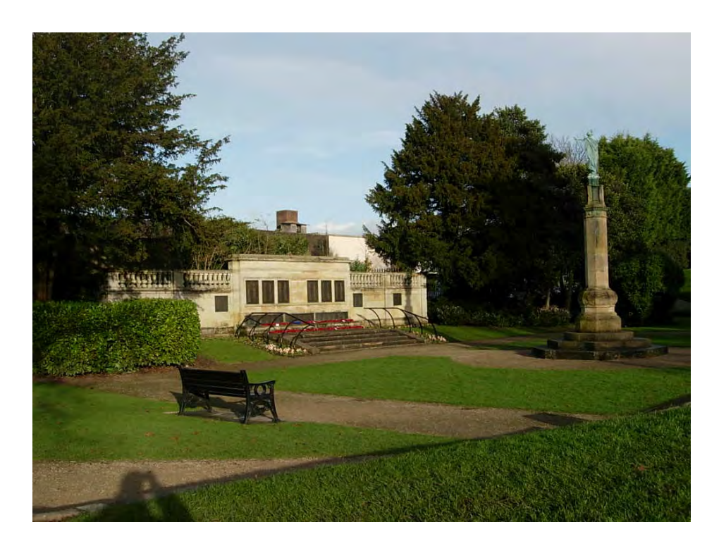
The First and Second World War Memorials standing on the top of Castle Mound are relatively isolated from the remainder of the park and form the centre pieces of a formal space for quiet contemplation.