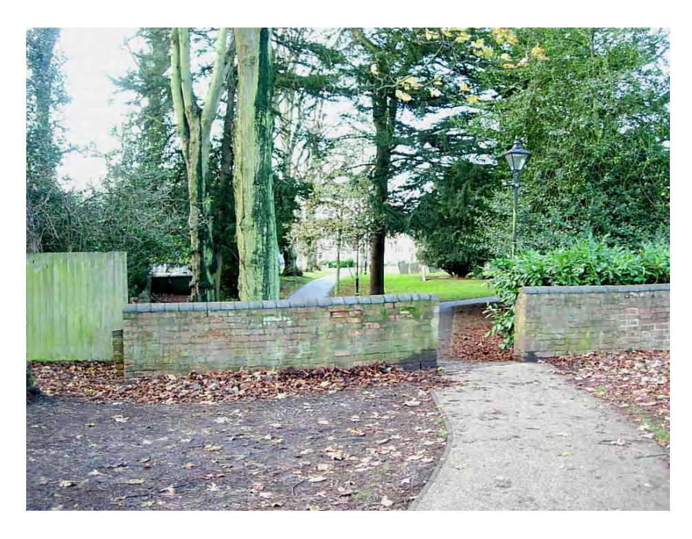
The brick boundary wall to the churchyard is capped with saddle back copings and plays a significant role in defining the character of the area that should be protected.