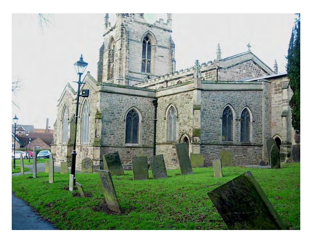
It is unfortunate that to assist grass cutting, the grave stones have been relocated and have lost their connection with the graves that they originally marked.