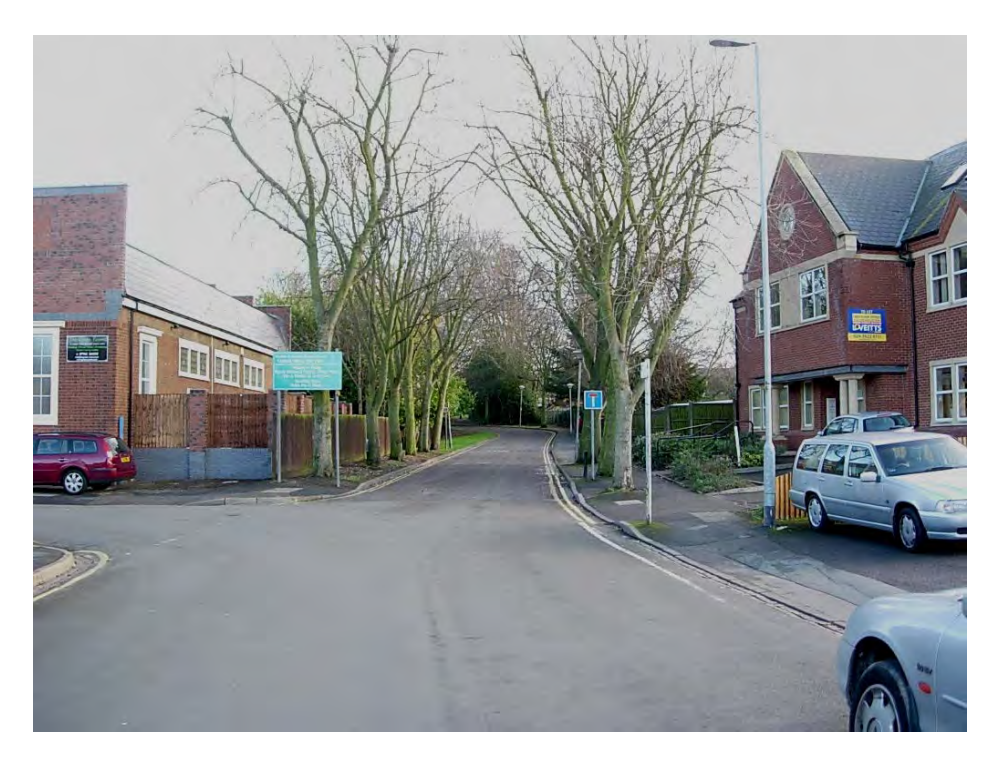
Looking eastwards along the tree lined access to the Hinckley & Bosworth Borough Council Offices from St Mary's Road.