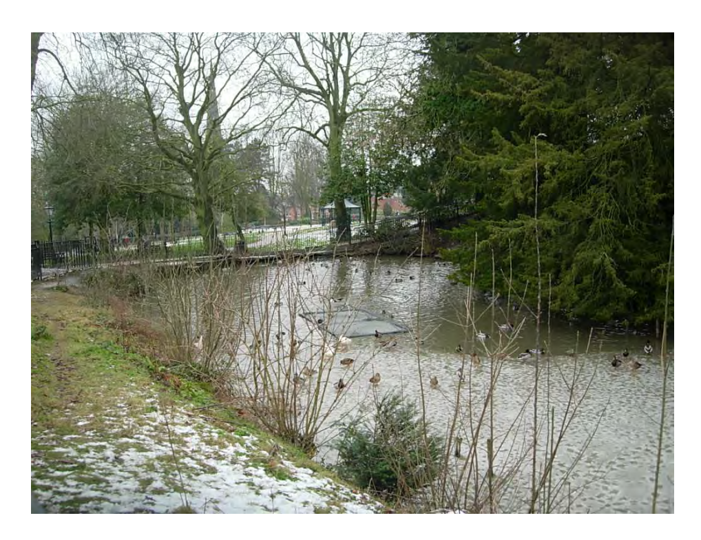
The moat in Argents Mead is a significant feature which is important to the setting of the Castle Mound.