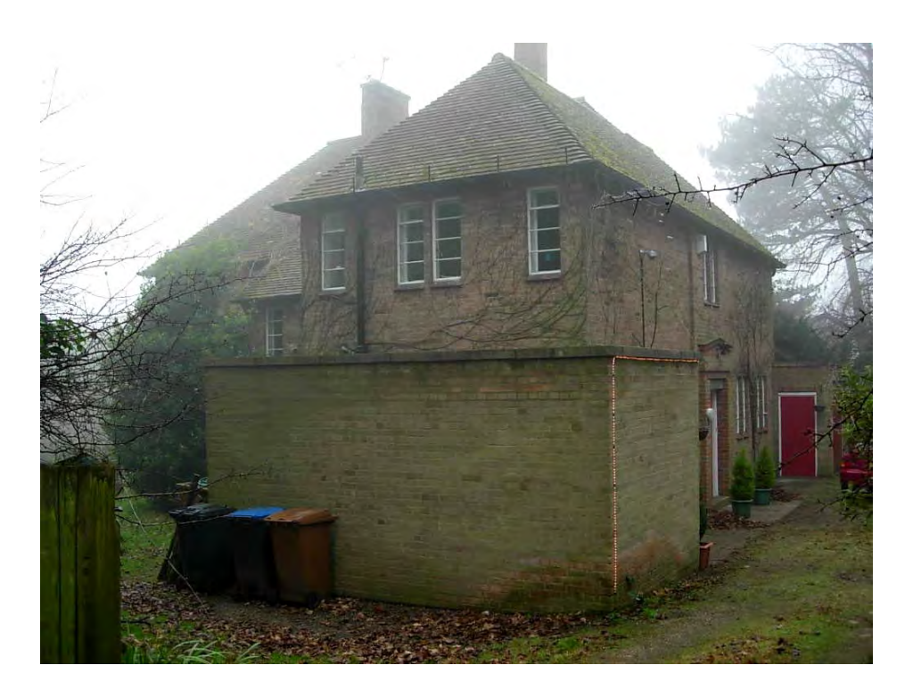
The former Rectory is not historically important and any proposal to demolish it will be supported. Any redevelopment of the site should be of traditional style and avoid the loss of mature trees.