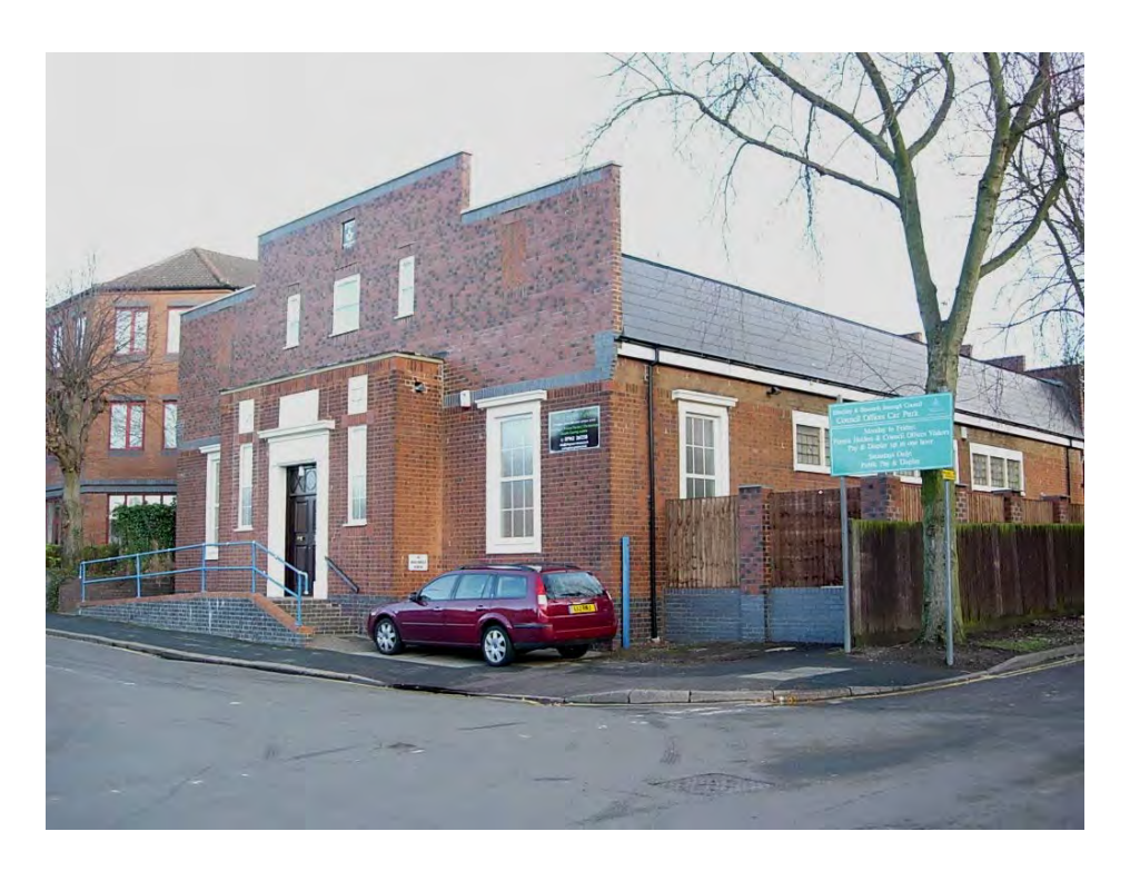
The Masonic Hall is a fine building which has recently had a second storey added.