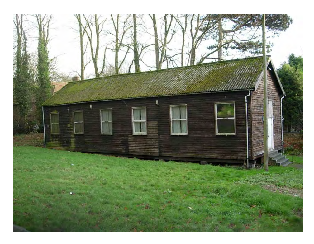
The removal of this temporary structure used as a scout hut is supported.