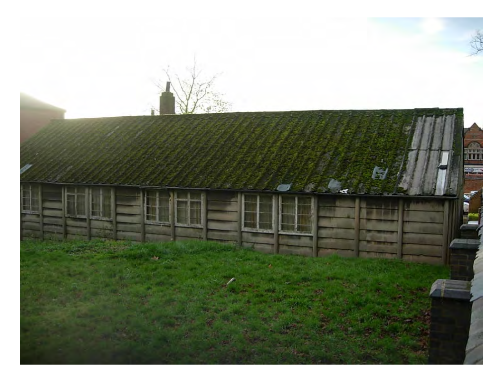
The removal of this temporary structure in the grounds of the vicarage is also supported.