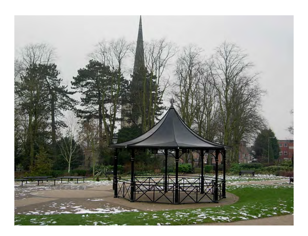
The bandstand is a significant structure in Argents Mead.