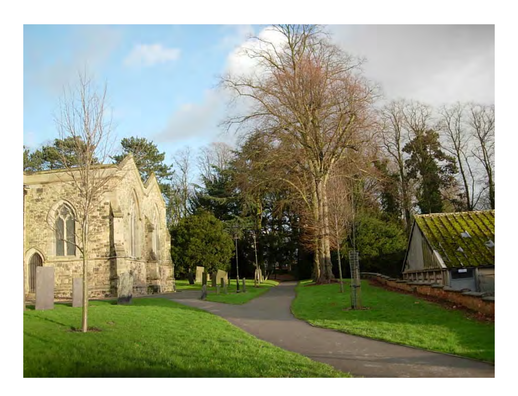
A typical view of the many surrounding mature trees within and adjacent to the churchyard that are highly important to the setting of this Grade II* church.