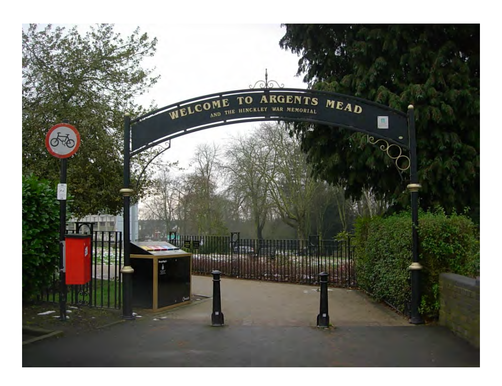
The pedestrian entrance into Argents Mead from Castle Street suffers from street clutter.