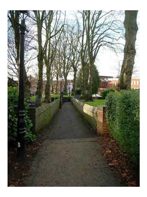
This is an extension to the Bell Entry jitty which links into Castle Street. Its boundary walls, narrowness, heritage lamp posts and tree lined edges add significantly to the character of the churchyard.