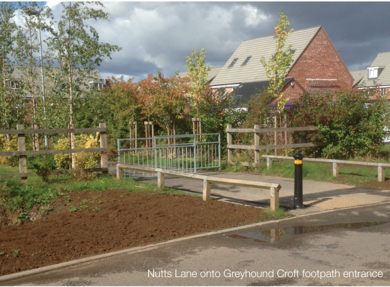
Nutts Lane onto Greyhound Croft footpath entrance