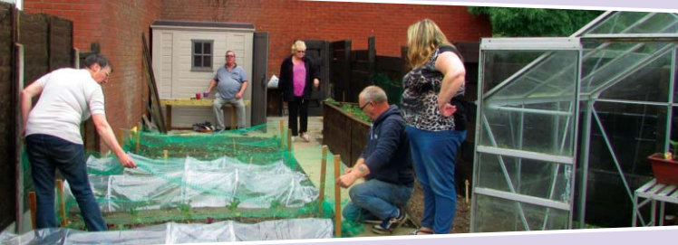
We will ensure that council tenants and applicants are able to develop the skills needed to maintain their tenancy. We will take measures to address the social stigma reported by social housing tenants.