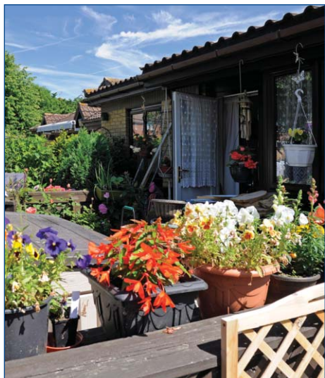
Tom Eatough Court