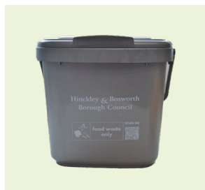
Kitchen caddy (you can use your own container if this is unsuitable for your needs)