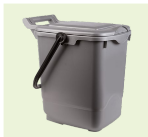
Outside food waste recycling bin

If you have not received these please scan the QR code on the back visit: www.hinckley-bosworth.gov.uk/foodwaste or call: 01455 238141