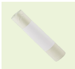
Starter roll of compostable liners